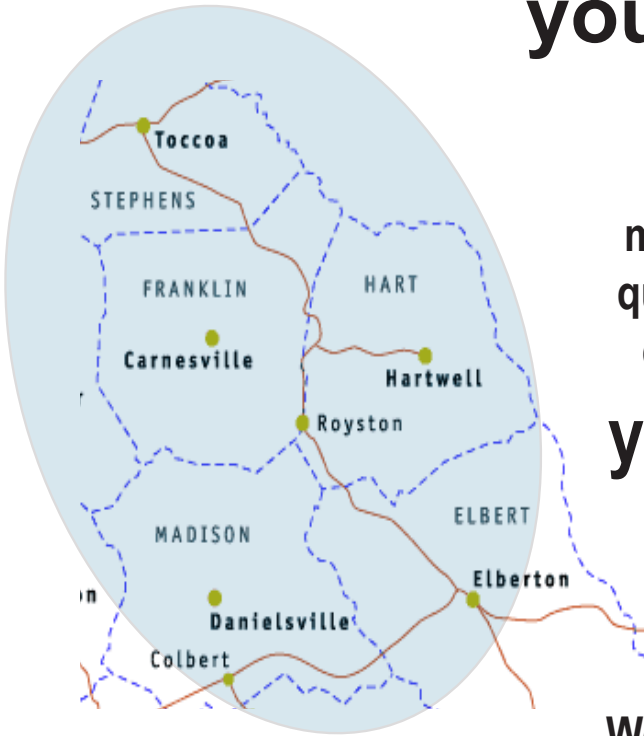
FSHME- Franklin, Stephens, Hart, Madison & Elbert